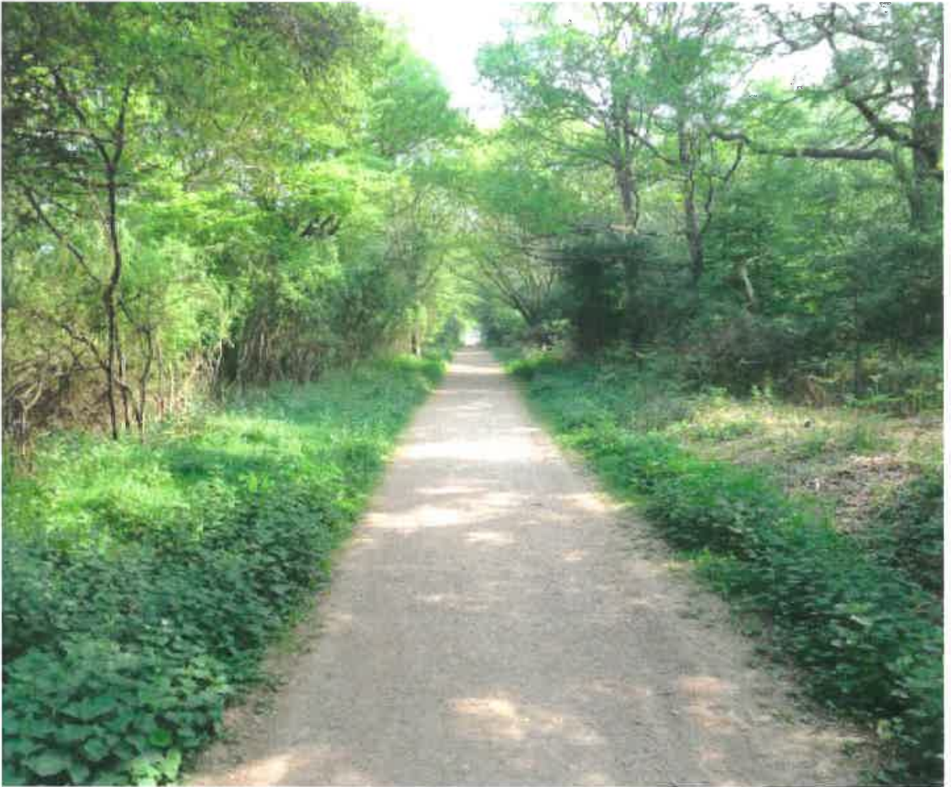
Indicative example of hoggin-type path through woodland (CEDEC)