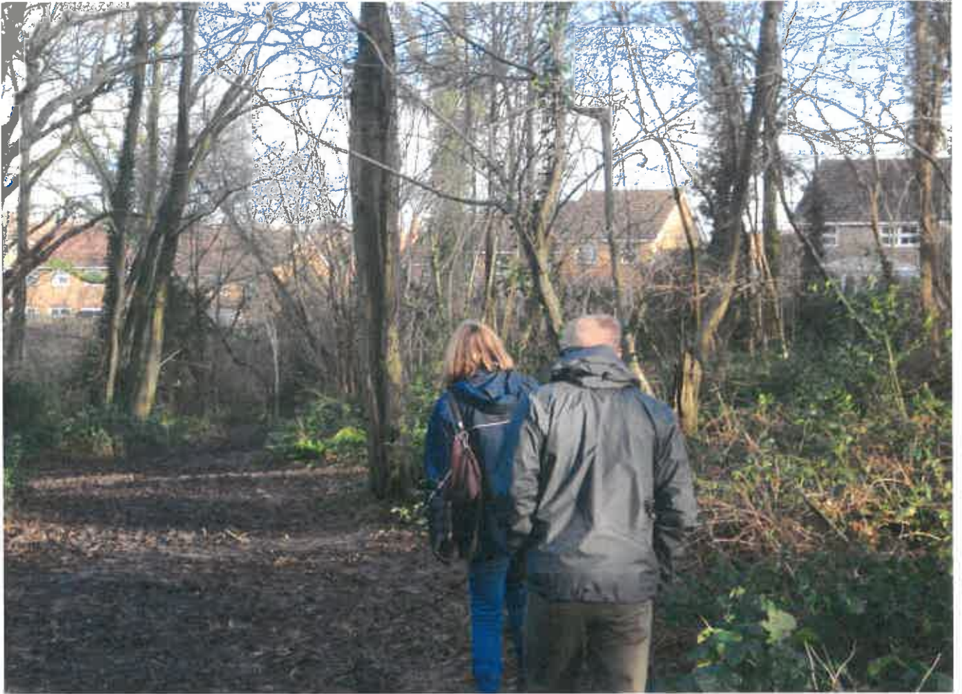
Existing (unsurfaced) path through Boothland Wood (January 2014)