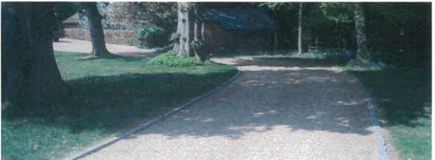
Indicative example of permeable-surface footpath through Victoria Pleasure Grounds

Ridgewood Farm Sketch Footpath Proposals Welbeck Strategic Land LLP