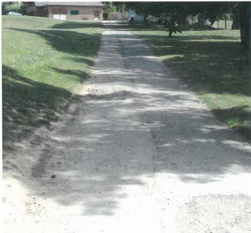
Existing path through Victoria Pleasure Grounds (May 2011)

Ridgewood Farm Sketch Footpath Proposals Welbeck Strategic Land LLP