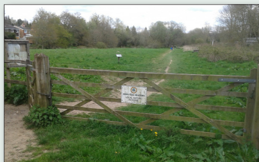
Main entrances from the Waitrose Car Park and Hempstead Meadow playing field.