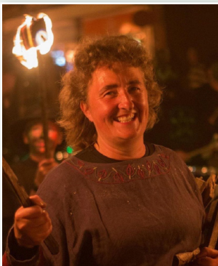
Sussex Bonfire Pics

I am honoured to be the Chair of the Society and this year we celebrate 190 years of activity in the community. We hope everyone comes out and