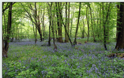
Entrance from New Barn Lane or through the back of Victoria Park.