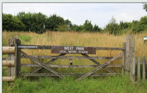
Main entrance and parking at the top of Princes Close. Entrances also at Hart Close and Egles Grove.