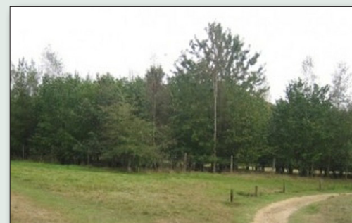
Main entrance beyond Ridgewood Recreation Ground, off New Road.