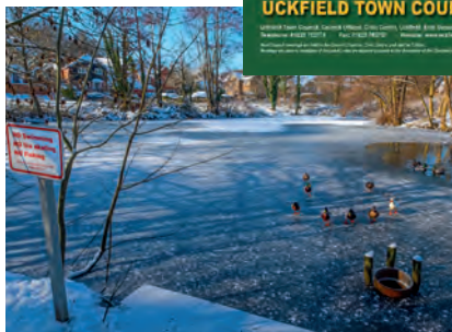
Third Place - Can't those ducks read! by Jonathan Close