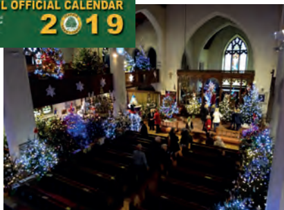
Commendation Award - Christmas Tree Festival by Sue Garland