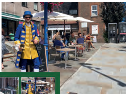
Second Place - The Town Crier Spreading the News by Mike Skinner