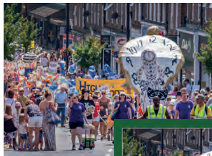
First Place - Uckfield Festival Children's Parade by Jonathan Close

The theme for the 2020 Calendar was announced as 'Uckfield at Work, Rest and Play'. The competition for 2020 calendar begins in January 2019 and details will be added to the Uckfield Town Council website and social media.