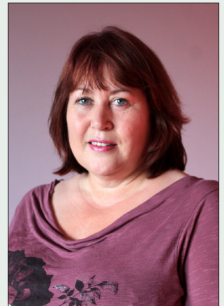
Ron Hill Photographic