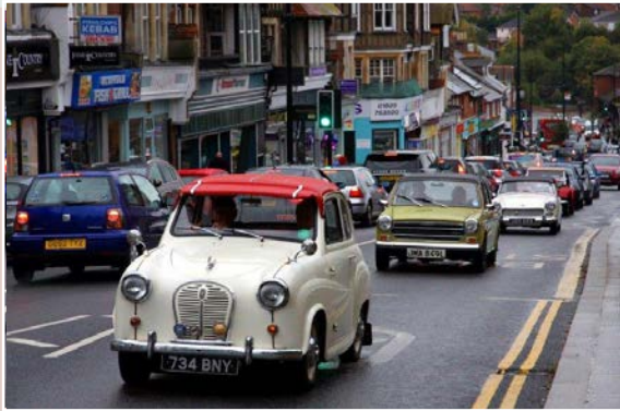
Ron Hill Photographic

The assembled vehicles were then despatched in groups of various makes, chaperoned by members of 4x4 Assist, parading through New Town and up the High Street into Library Way before forming a fantastic display on Luxford Field.