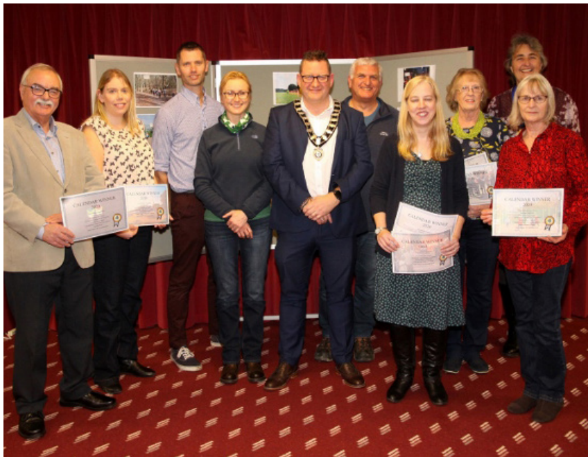
Calendar Photograph Competition winners at the presentation on 28 November 2019