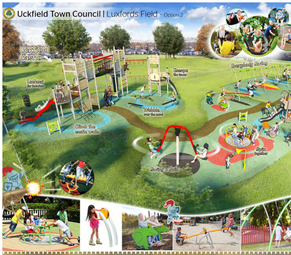
Part of the initial winning design by HAGS

In addition to the chosen design we are also investigating further suitable equipment for wheelchair users for this important central facility.