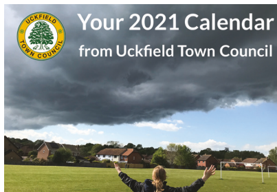
Your 2021 Calendar from Uckfield Town Council

We will be looking for images (photographs or illustrations) that depict what Uckfield means to our younger residents. This could be a favourite place such as somewhere they meet for organised activities or where they go to be with their friends or siblings to play. It could be a photo that captures the beauty in our nature reserves; such as the rocks in West Park or the streams running through Hempstead Meadow. It may be a favourite shop or building in