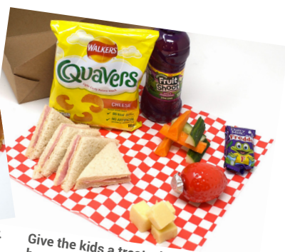
Give the kids a treat with their own picnic boxes!