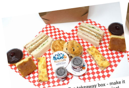
Example of the Afternoon Tea takeaway box - make it extra special by adding a bottle of sparkling wine!

Afternoon tea boxes and Children's picnic boxes are also available to take away if ordered the day before.