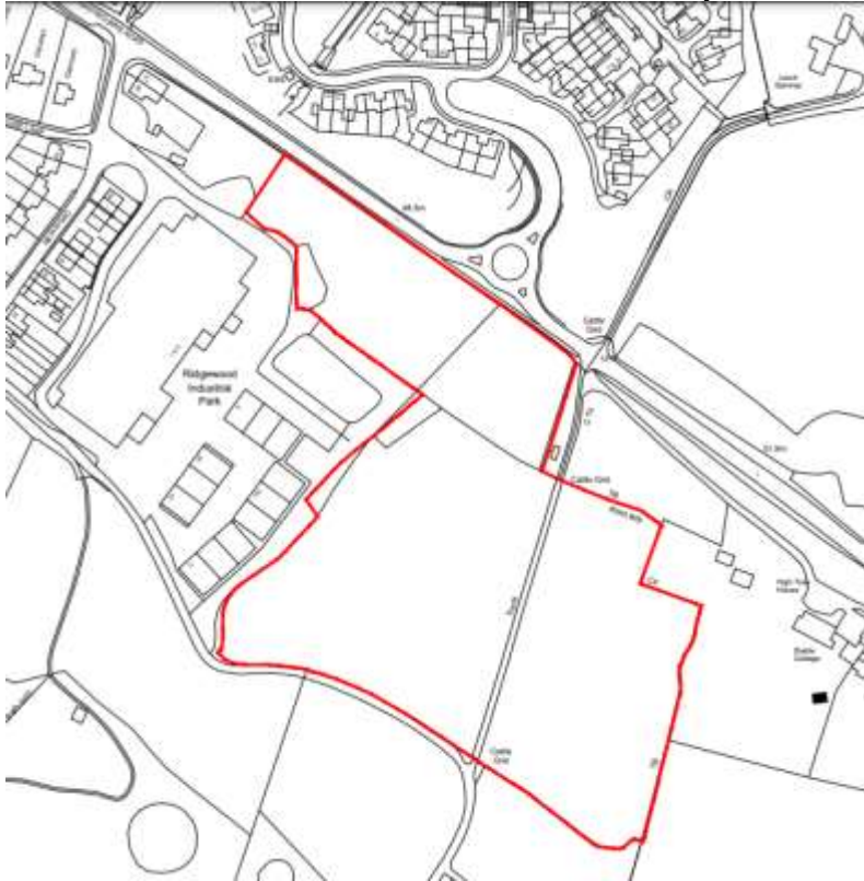
Figure 1: Extract from Site Plan (2020)