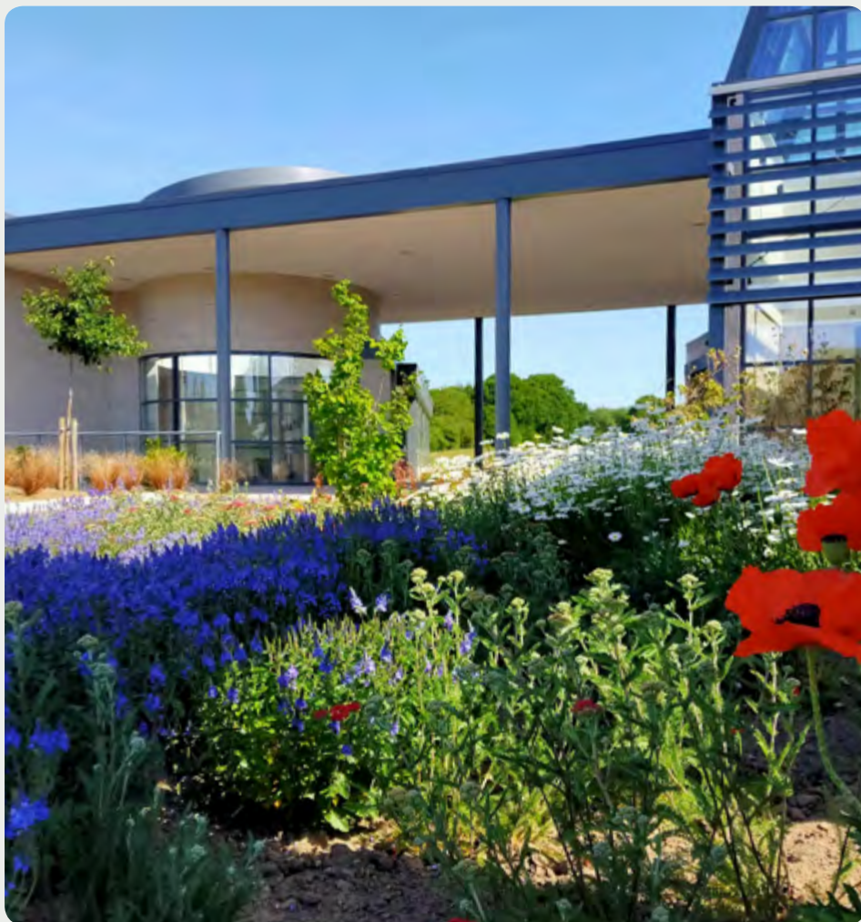
Spring at the Wealden Crematorium