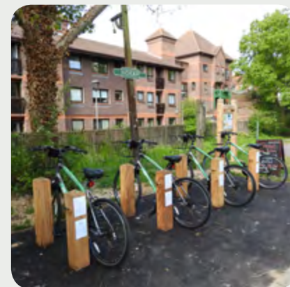
Cuckoo Trail bike hire, Horam