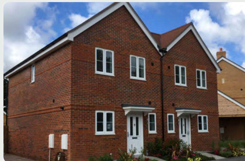
Affordable housing, Woodpecker View, Crowborough