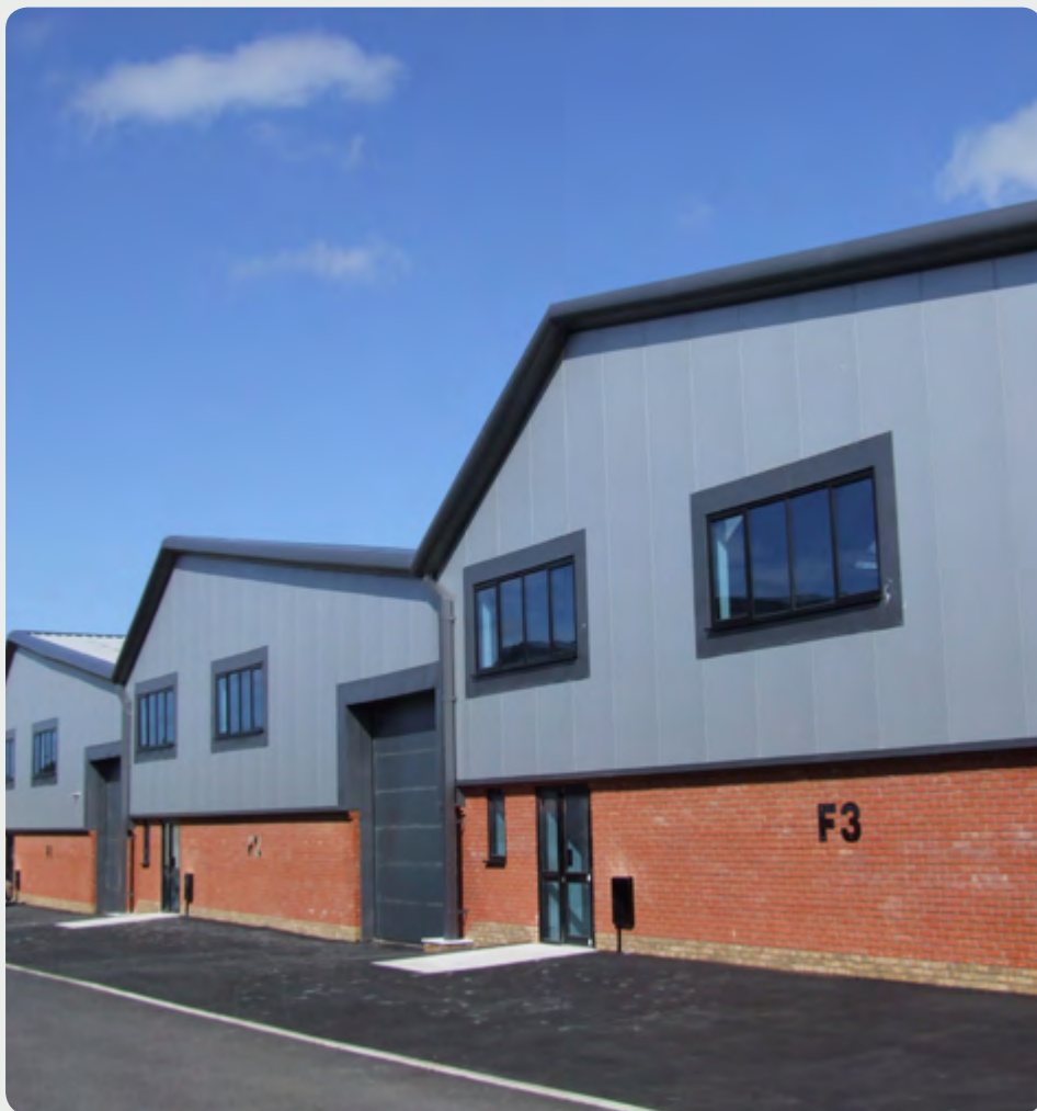
Chaucer Business Park, Polegate

Progress against the delivery of this Corporate Plan and its objectives will be managed and reported on a regular basis. In-keeping with our commitment to transparency and accountability, quarterly reports will continue to be considered at Cabinet and Overview and Scrutiny committees. These reports will include updates against the priority objectives and relevant performance indicators measuring the impact of our activities. These reports and the meetings will be publicly available on our website.