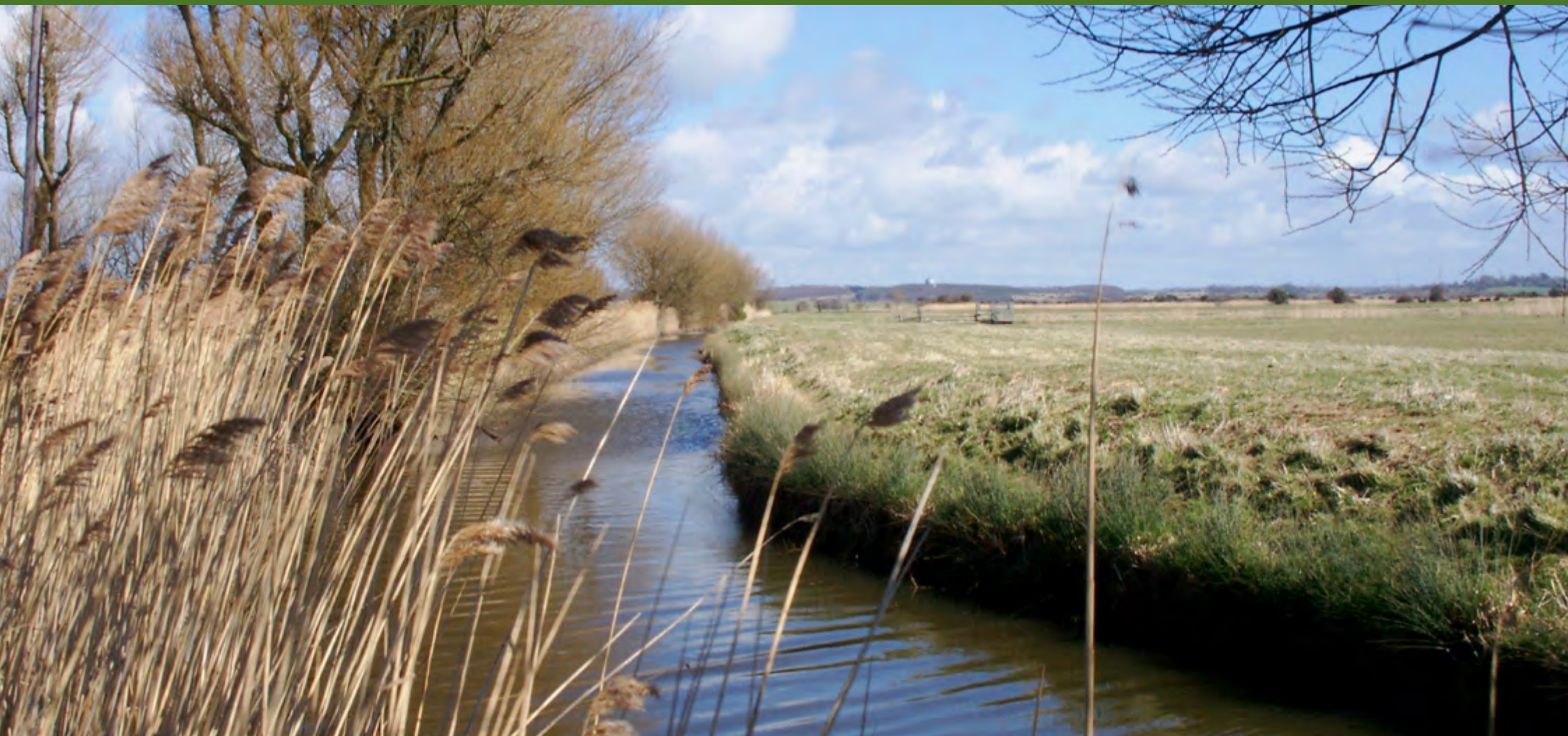
Pevensey Levels.