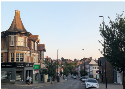
Uckfield High Street boasts a wide variety of retailers and services, from small local businesses and Sussex-based charities to national companies.

At the time of going to press on 15 June, the latest statement from local councils was as follows: "Uckfield High Street remains open for business with access available throughout the High Street. "The town's car parks remain open and pedestrians are able to move about freely to reach retail outlets, cafes and services. Wealden DC is working closely with East Sussex CC, Uckfield TC and Uckfield Chamber of Commerce to resolve the matter.